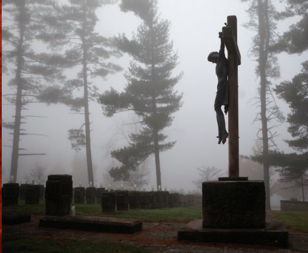
A crucifix in the Archabbey Cemetery commemorates the greatest gift, Jesus' death to redeem the human family.