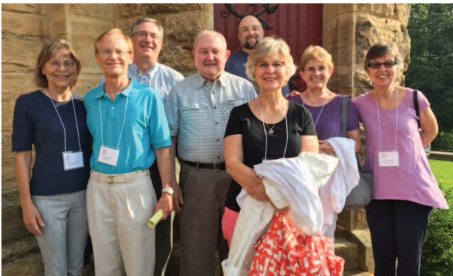
Some of the Bloomington oblates and visitors for Saint Meinrad Oblate Day of Recollection 2017.