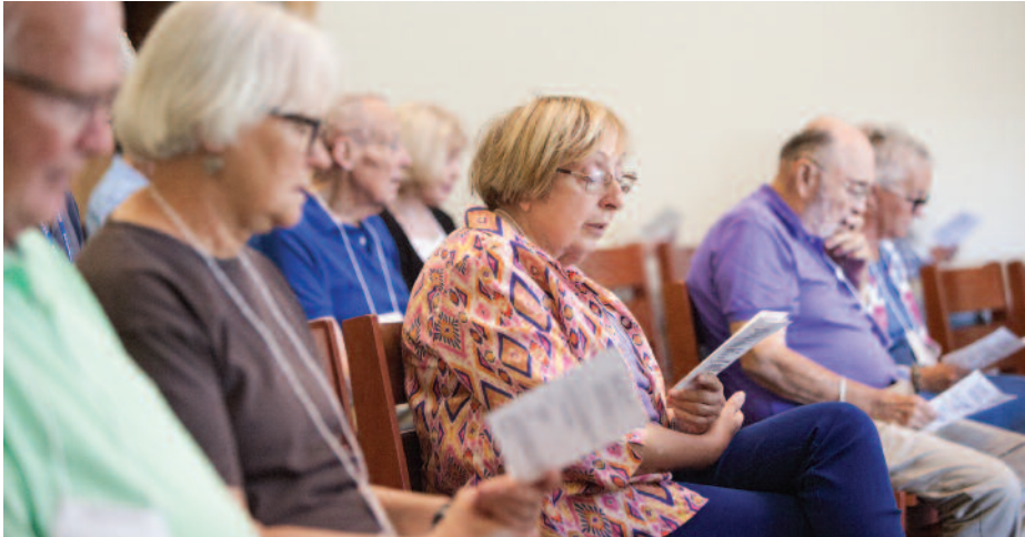
Oblates gather in the Guest House Chapel for Noon Prayer during Oblate Study Days, June 12-15, 2017.