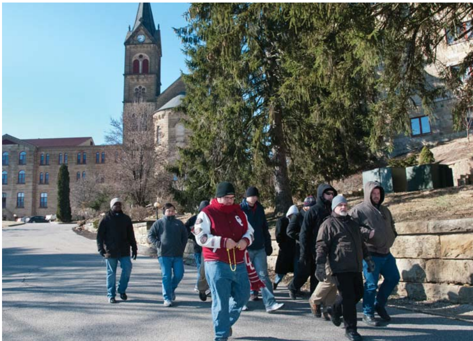
▲ Students make an annual pilgrimage to the Monte Cassino Shrine in thanksgiving for Our Lady's intercession during a smallpox outbreak in 1871.