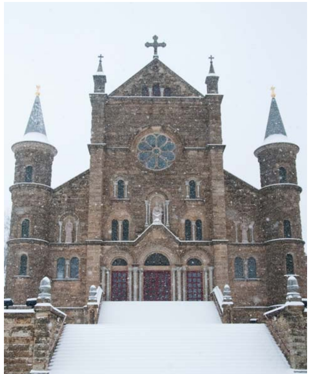
Snowfalls in February and March covered the Archabbey in quiet beauty. More photos of recent events are on Pages 9 and 12.

Send changes of address and comments to: The Editor, The Development Office, Saint Meinrad Archabbey and Seminary & School of Theology, 200 Hill Drive, St. Meinrad, IN 47577, (812) 357-6501 • Fax (812) 357-6759, news@saintmeinrad.edu www.saintmeinrad.edu , © 2015, Saint Meinrad Archabbey