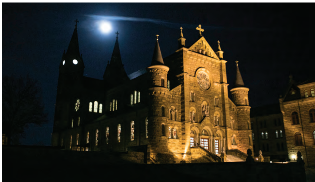
The super moon rises behind the Archabbey Church on January 31.

Archabbot Kurt Stasiak, OSB Saint Meinrad Archabbey