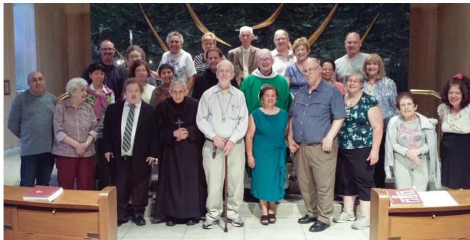
The New York oblates posed for a picture after the closing Mass of their annual retreat, during which two were invested as oblate novices and two oblate novices made their oblation.