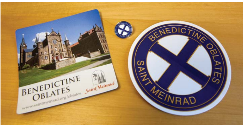
The oblate pin, window cling and car magnet can be purchased from the Oblate Office.