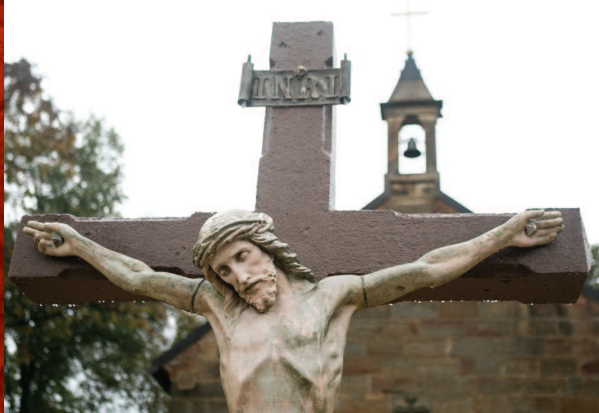
The crucifix at Monte Cassino Shrine is seen on a rainy afternoon.