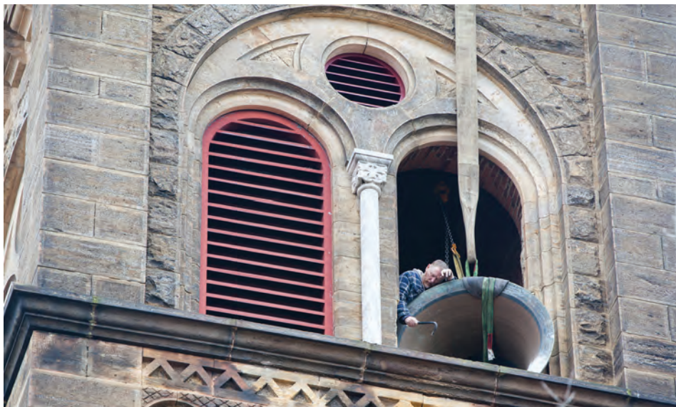
▲ A worker chips away sandstone to allow Bell #6 to be removed for repair.