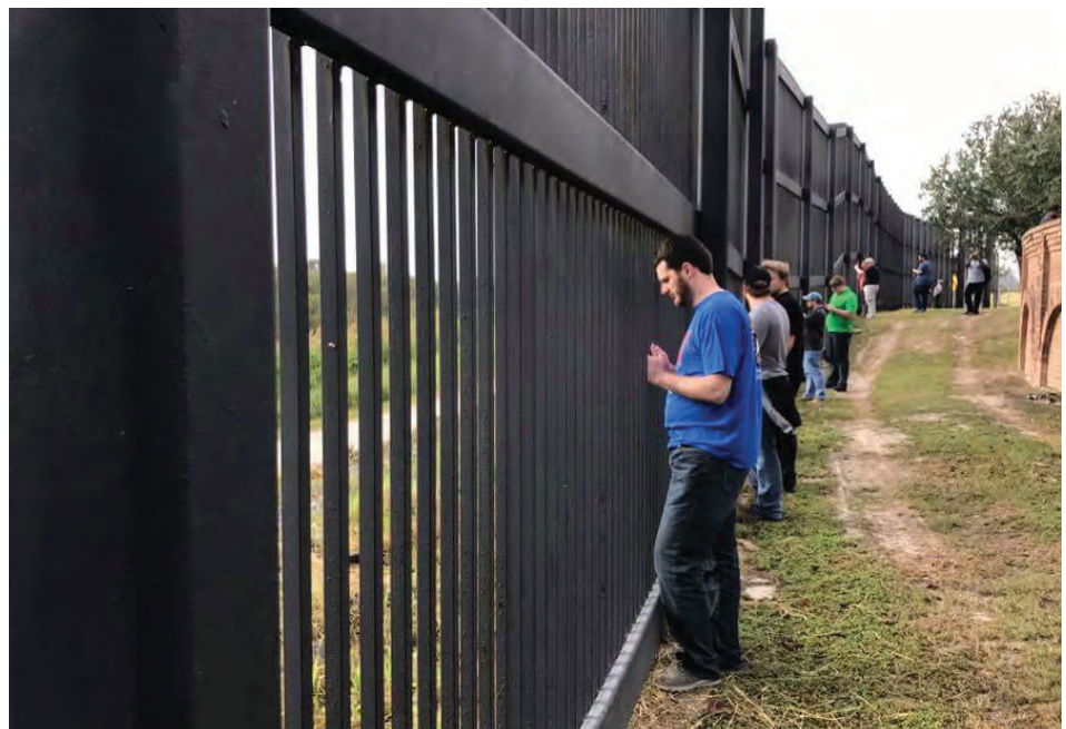
▲ Praying at the Mexican border is part of the experience of seminarians who spend two weeks in January learning about Hispanic ministry.

I do not know how to fix our nation's broken immigration system. However, I do know that one day I will be judged on how I treated the least of these. I pray that on that day Jesus will look on my thoughts, my words, and my actions and be able to say, "I was a stranger and you welcomed me" (Mt 25:35). ✚