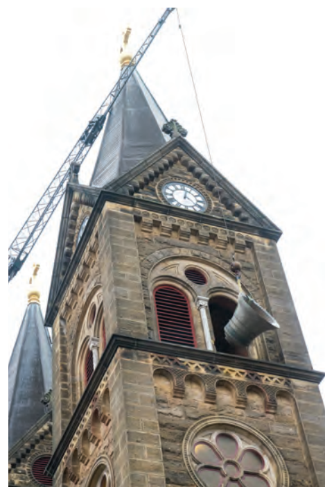
▲ A crane lifts Bell #6 from the church tower on February 8.

A little joke in the monastery is that the bells are the voice of God calling the community to prayer. That voice has temporarily been silenced.