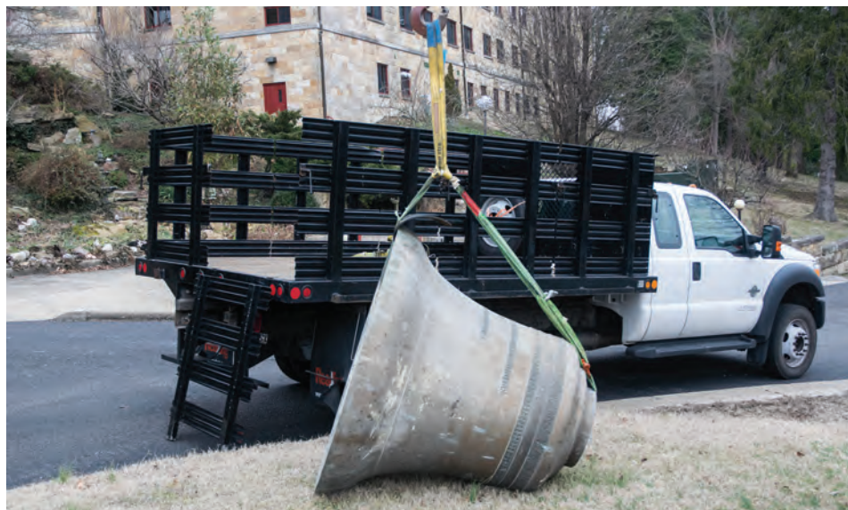
▲ Bell #6 weighs 2½ tons and measures 52 inches high. It was installed in the Archabbey Church on July 2, 1997.

Those who wish to make a gift toward the bell and clock repairs can do so at: donate.saintmeinrad.edu . ✚