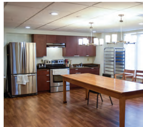
▲ Top: Larger bathrooms in the infirmary are easier to use for those in wheelchairs. Bottom: A dining area in the infirmary allows monks to gather as a community for meals.

The infirmary renovation was estimated to cost $1.6 million. A campaign was launched in 2015 to raise money to offset those costs. The campaign was successful, bringing in over $1.7 million. ✚