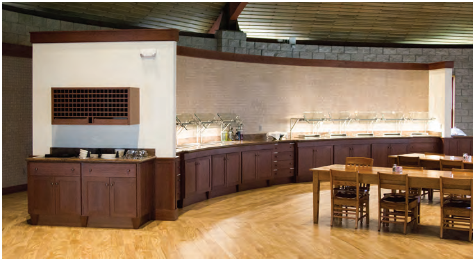
▲ The refectory (dining room) received a makeover during the monastery repairs, with a new serving area, flooring and roof.

With most of the renovation work complete, the monastic community moved back into the monastery at the beginning of August and the infirm monks moved into the infirmary in September.