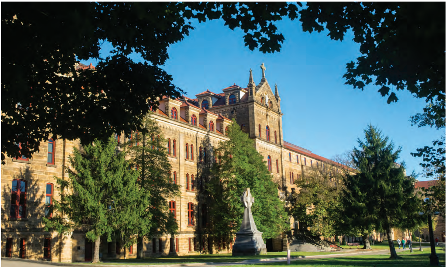
▲ Saint Meinrad Seminary and School of Theology campus in October right before the leaves changed color.