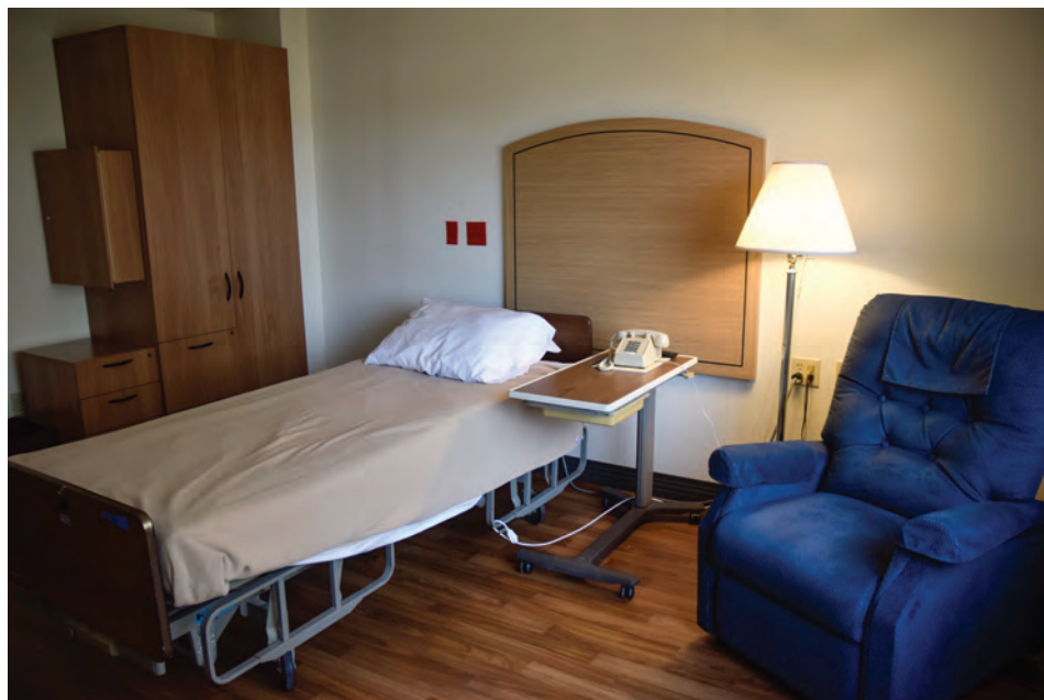
▲ The renovated infirmary rooms are larger, with wider doorways for ease in getting around.

The infirmary renovation was estimated to cost $1.6 million. A campaign was launched in 2015 to raise money to offset those costs. The campaign was successful, bringing in over $1.7 million. ✚