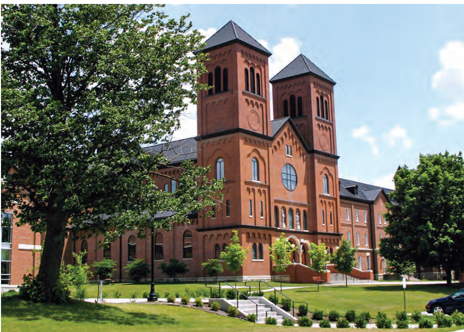
▲ Conception Abbey in Missouri will host one of the “One Bread, One Cup” youth conferences this summer.

When asked what the youth will find at the conference in Conception next summer, Becht can already picture the